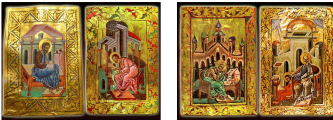
Fig.2 The illuminated miniatures in the Anonymous Gospel Book representing the four Evangelists: Mark and Luke, Matthew and John.

contains four miniatures (Fig.2) and 380 parchment sheets written in Slavonic by an anonymous calligraphist. The covers are made of gilded silver worked au repoussé 1,2 .