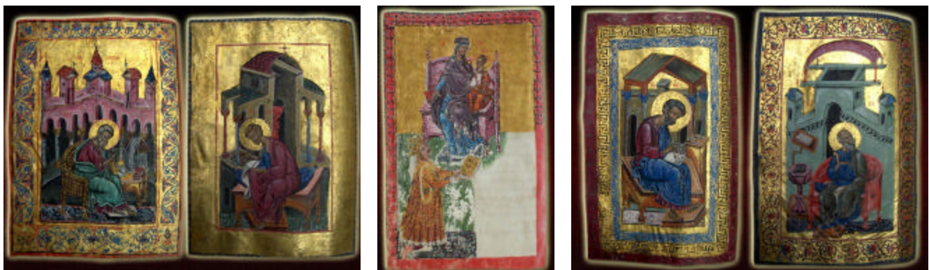
Fig.1 The five illuminated miniatures in the Humor Gospel Book representing the Evangelists Matthew and Luke, Stephen the Great kneeling at the feet of the Virgin with Child on the throne, and the Evangelists Mark and John.