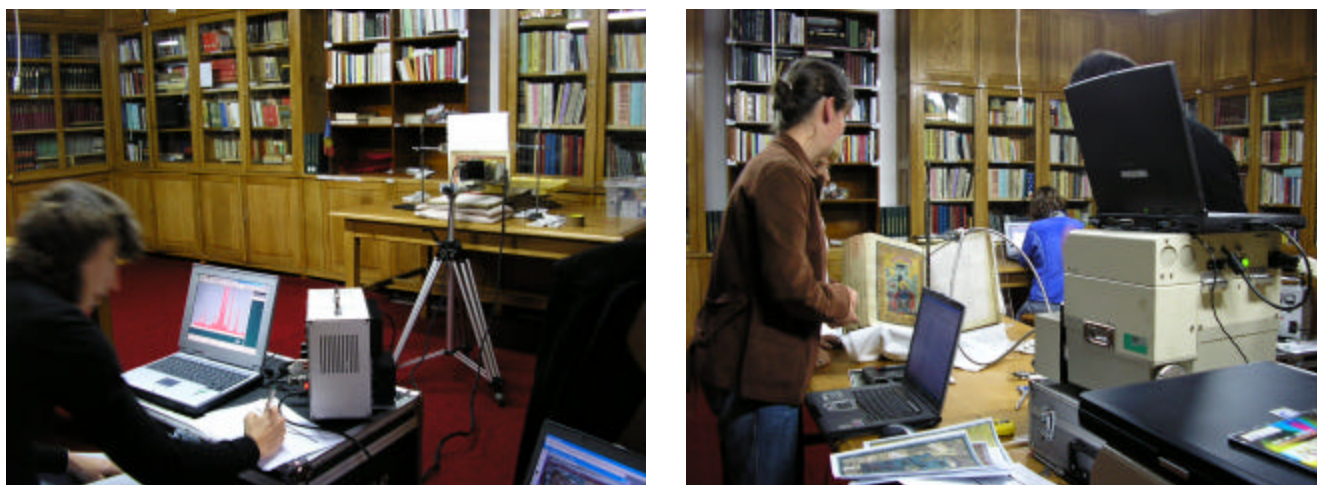
Fig.3 MOLAB team performing in-situ XRF analysis on the Evangelist Matthew's miniature page (Humor Gospel Book), and Mid FT-IR and NIR on the Evangelist John's page (Anonymous Gospel Book)

The results obtained permitted identification of almost all the pigments used in the miniatures and decorations. Interesting information on inks composition, on the possible nature of some of the binders in miniatures and on metal cover composition was also obtained.